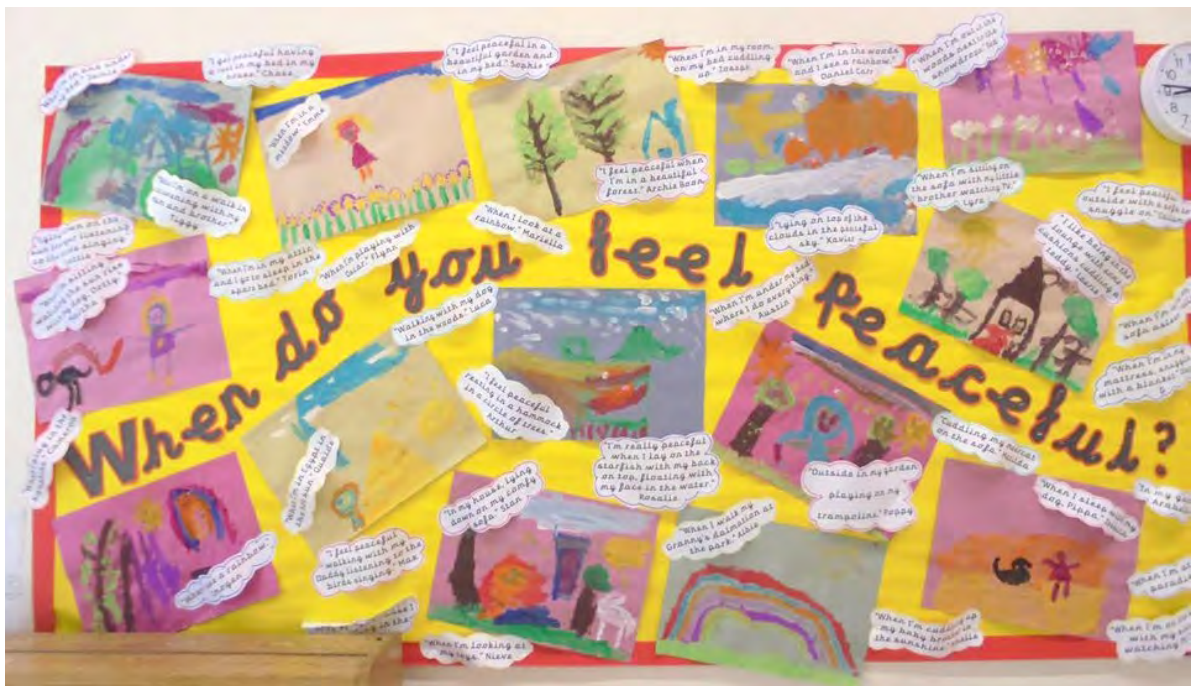
Reception/Y1 reflect on when they feel peaceful.